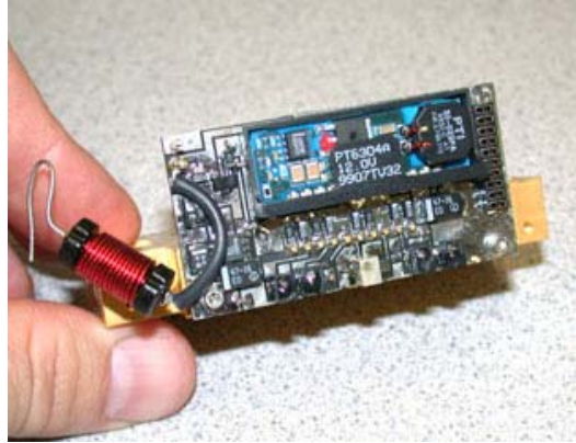
Bias Board View

The amplifier includes a bias board mounted to its side, which supplies the necessary gate and drain voltages, with the proper sequencing. A DC-DC converter is included at the board's input (large rectangular module towards the top of the board) which allows for a wide range of operating voltages. Nominal input voltage is +12 VDC; however, the amplifier will work with an input range of +8 to +15 VDC.